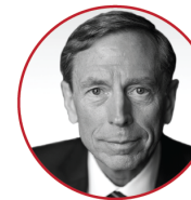
Gen. David Petraeus Former Director of the CIA

"I don't think there ever has been a period in which we see as many varied threats to security: Islamist extremists, populism, the pandemic, the extraordinary rise of China, resurgence of Russia, malign activities in the form of militias in the middle east. There are very serious challenges that cannot be dealt with just by government or the private sector."